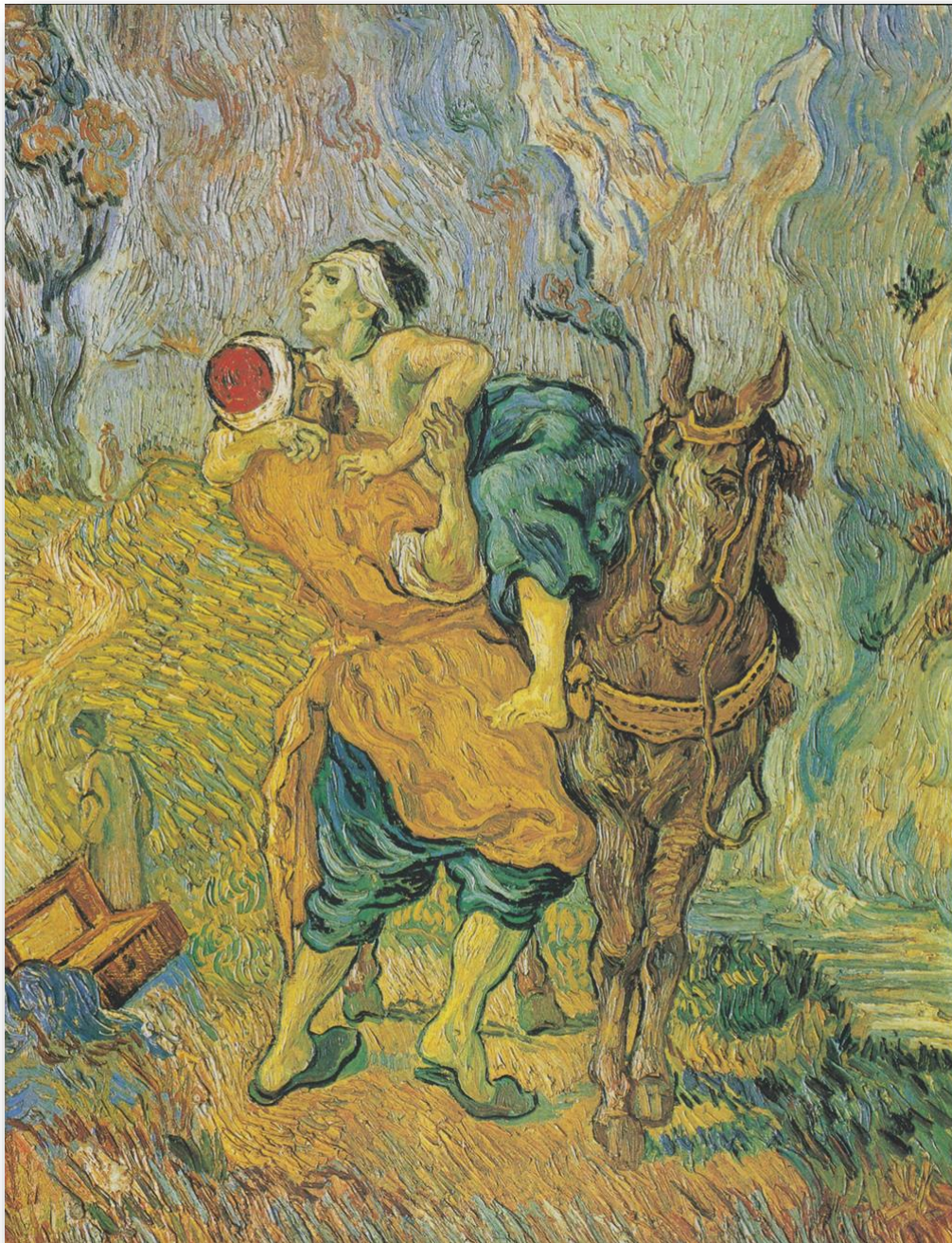
The Good Samaritan by Vincent Van Gogh

https://bible.usccb.org/bible/readings/071022.cfm