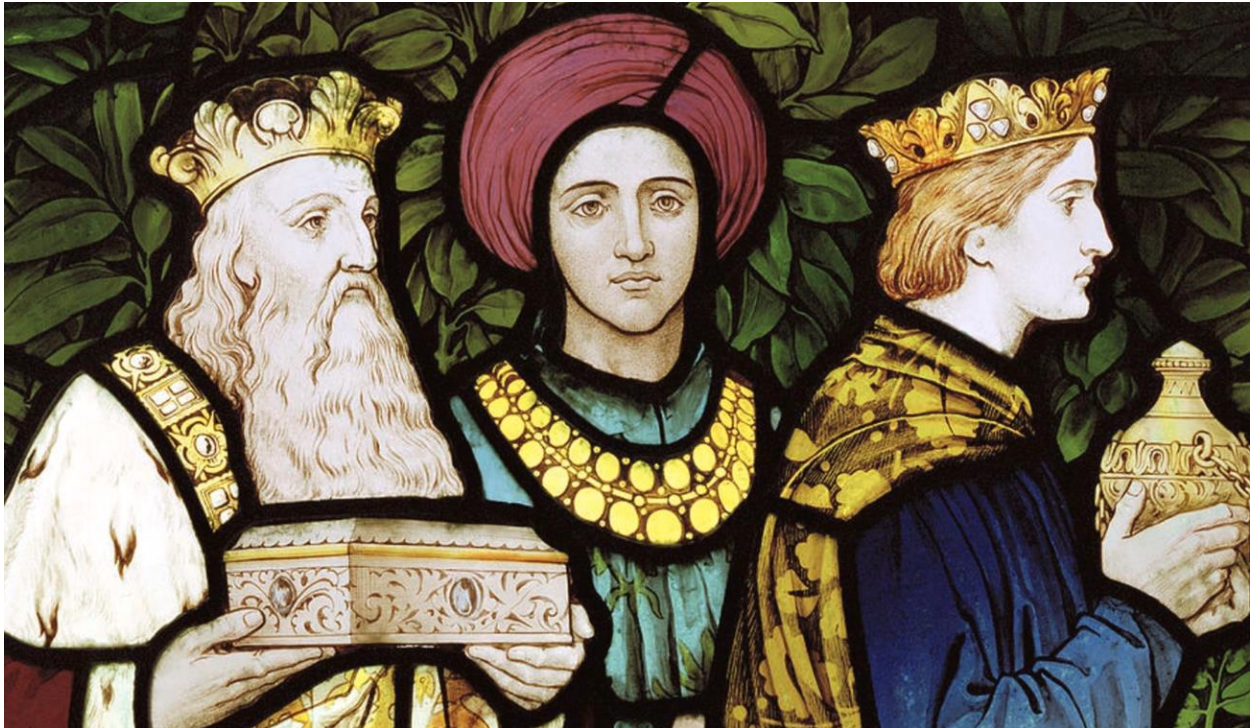
The Magi by Henry Holiday