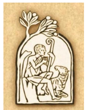
Catechism of the Catholic Church

(Romans 5:5.; Hebrews 6:19-20; 1 Thessalonians 5:8; and Romans 12:12)