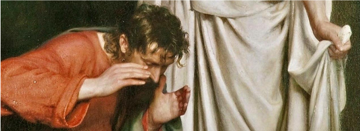
The Doubting Thomas | Carl Hendrich Bloch