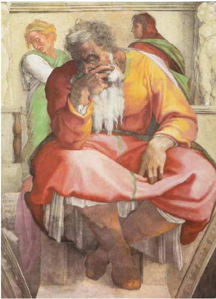
Prophet Jeremiah by Michelangelo

We know from the prophet Jeremiah in the Old Testament, that during his long ministry, Jeremiah was tempted at times to lose heart. He would pray about it and pray through it.