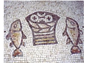
Church of the Multiplication

What was left over was gathered up, twelve baskets of broken pieces.'