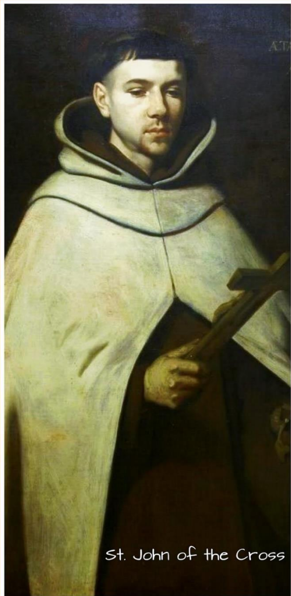
St. John of the Cross