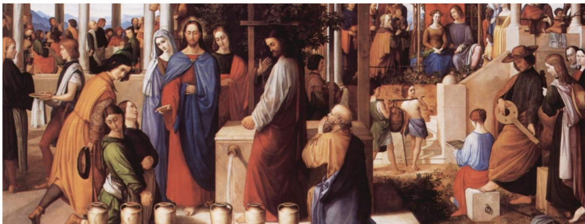
The Wedding Feast at Cana, c. 1815 by Julius Schnorr von Carolsfeld