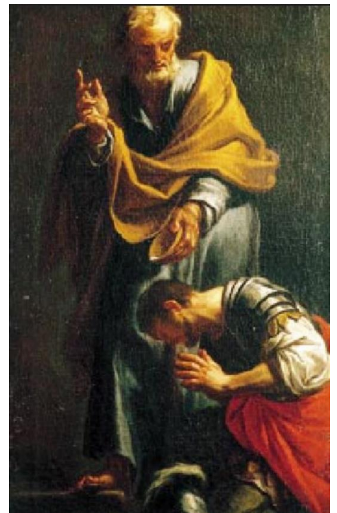
Peter Baptising the Centurion Cornelius, by Francesco Trevisani, 1709

So he ordered them to be baptized in the name of Jesus Christ. Then they invited him to stay for several days.”