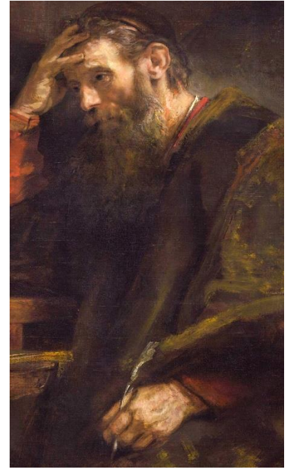
St. Paul | Rembrandt

We have also included a short YouTube video reflection produced by our parish Care for Creation group reflecting on Pope Francis message - World Day of Prayer for the Care of Creation - 1 September 2020 - and for the Season of Creation 2020.