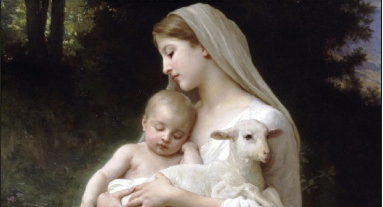
L'Innocence by William Bouguereau