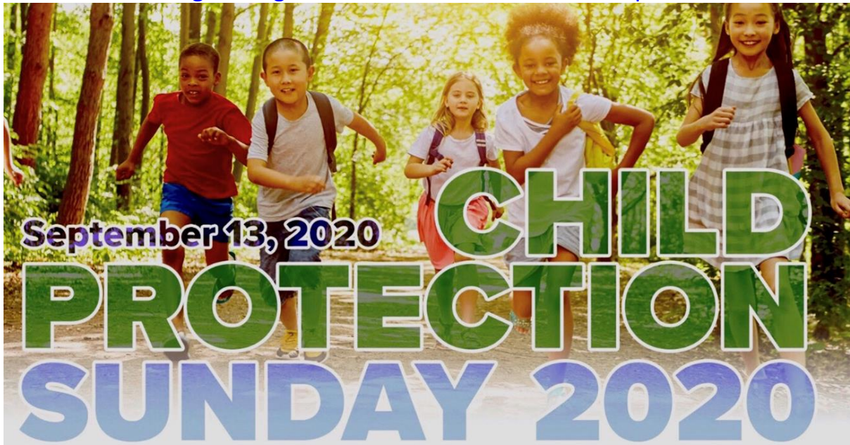
Image from Australian Catholic Bishops Conference, Child Protection Sunday 2020