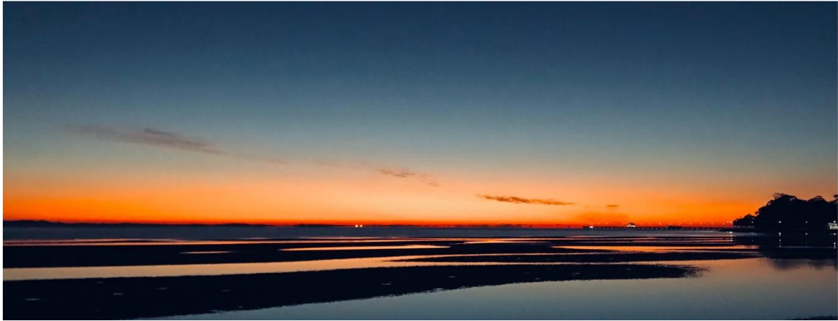
Sandgate Foreshore - 5.30am, 28 August 2021