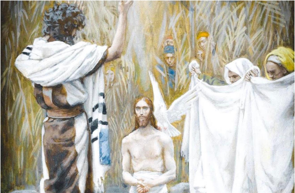
Baptême de Jésus - James Tissot | public domain | edited www.stjosephsbrackenridge.com