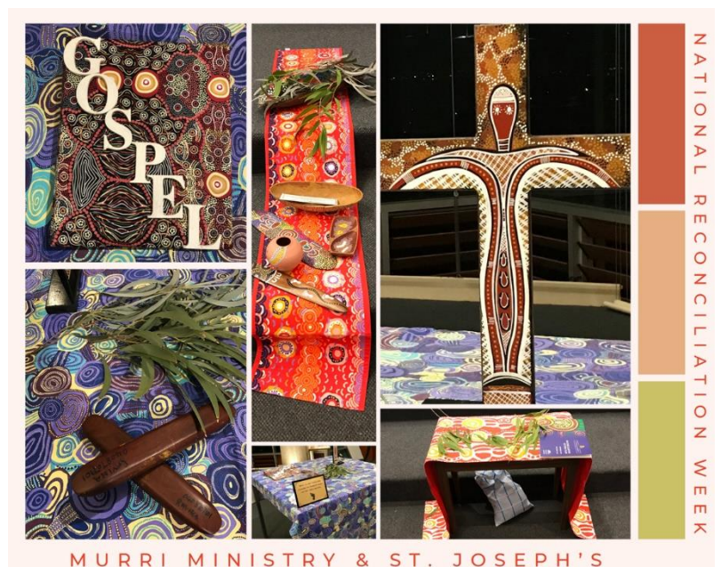
Aboriginal artefacts from Murri Ministry