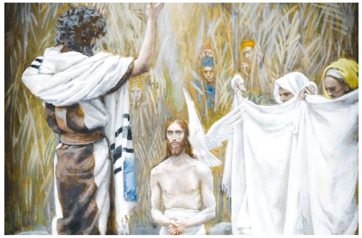
Baptême de Jésus - James Tissot

THE BAPTISM OF THE LORD (YEAR B) - 10 January 2021